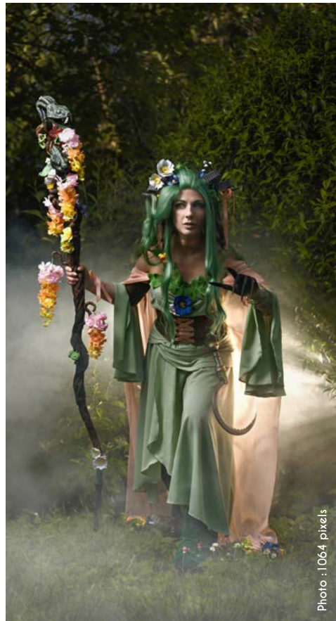
Photo : l064 pixels

I'm a French woman who does cosplay since the end of 2014 . I love sewing work, armor/props craft and bodypaint . I can easily embody from the sweet princess to the fierce warrior through the big bad evil villain. Constantly learning new things and making beautiful encounters are the things I love the most in cosplay. I try to be as active as possible on the cosplay scene and I'm always ready to discover new conventions and animations ! That's why I travel a lot (mainly in Europe).